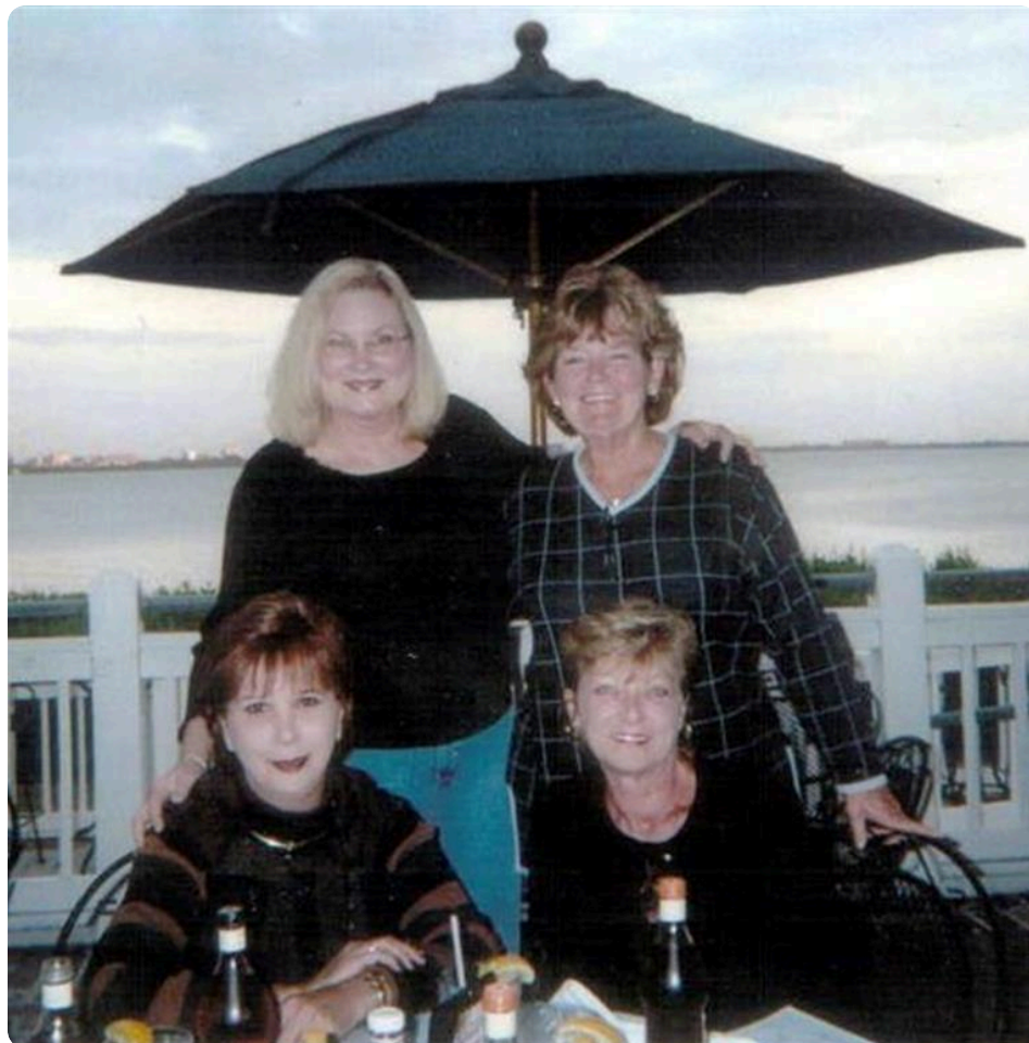
Friends Forever 2005